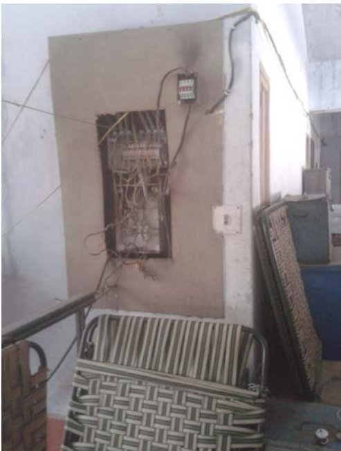
Fig 2: Hanging electrical wires at staircase first floor