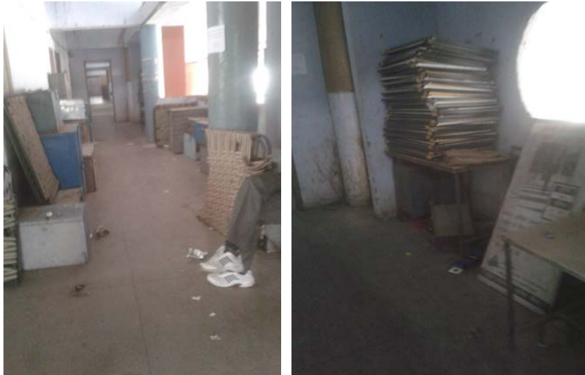
Fig 3: Blocked evacuation route (Corridor First Floor)