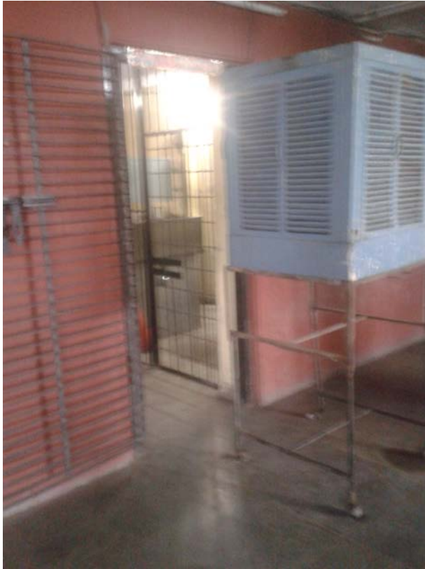
Figure 1: Blocked Evacuation of Cash branch ground floor