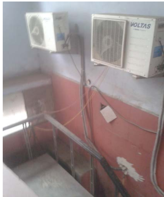
Fig. 3: Fallible objects in staircase