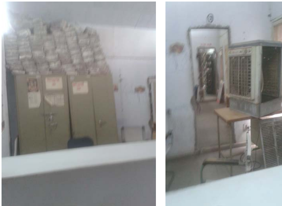
Fig 4: Fallible objects and blocked evacuation in Room no. 5 first floor (allotted to DTO Panchkula)